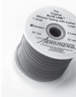
50 ft Reel

Standard Size Remains Flexible Heat Resistant to 450° F